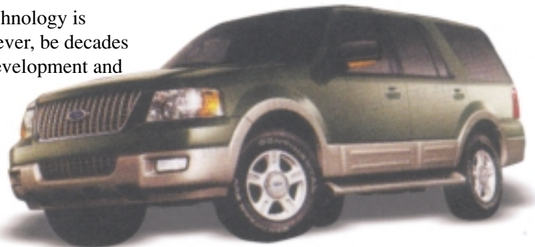
Ford Expedition 2003 12 mpg

Hydrogen fuel-cell technology is unproven and may, if ever, be decades away from efficient development and deployment.